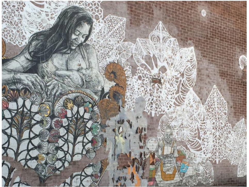
Dawn and Gemma, Swoon, 2014 - New Haven, CT, USA

Let's all together build a wall of art that demands support for all mothers and all babies!